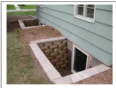
Guard Not Required Window well adjacent to grade