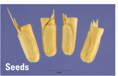
STEVE HURST @ USDA-NRCS PLANTS DATABASE