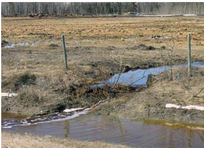
Runoff from a pasture should be diverted before it enters a shared water source.