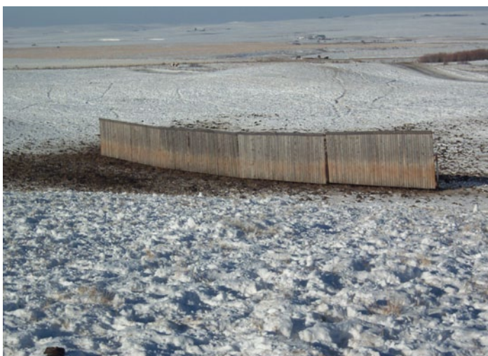
Consider where the spring runoff will carry the waste that accumulates by livestock windbreaks.