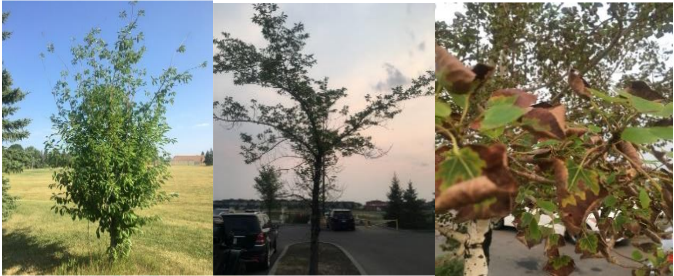
Picture 1: drought impacted trees with loss of periphery leaves ( L and C) and edge leaves browning ( R )