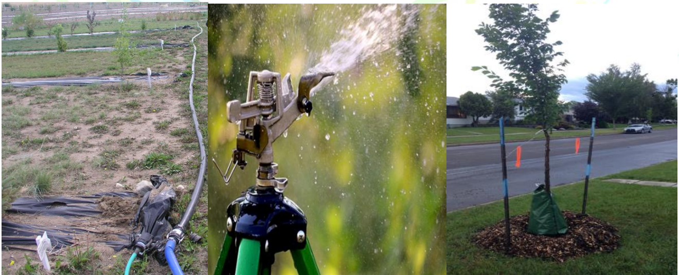
Picture 2: Watering systems – drip irrigation( L ), sprinklers( C ) and Gator bag ( R )