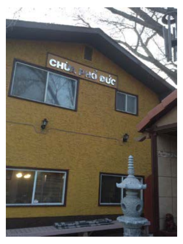
Figure 2&3: Outdoor area at 43 Dovercrest Way SE Calgary