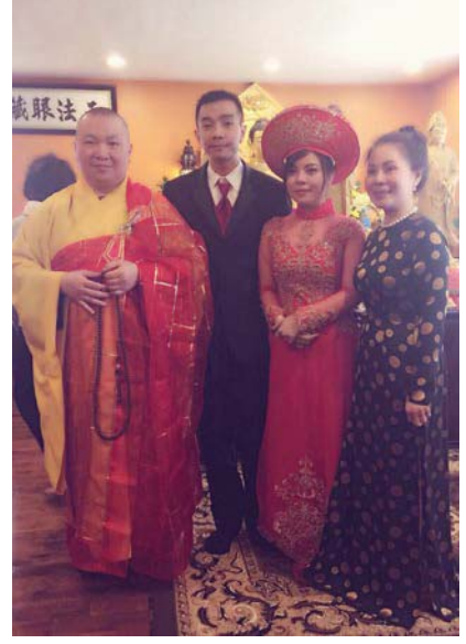
Figure 3: Alberta Health Services Card & Figure 4: Marriage Commissioner Ceremony