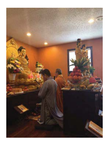
Figure 1: Mediation Session