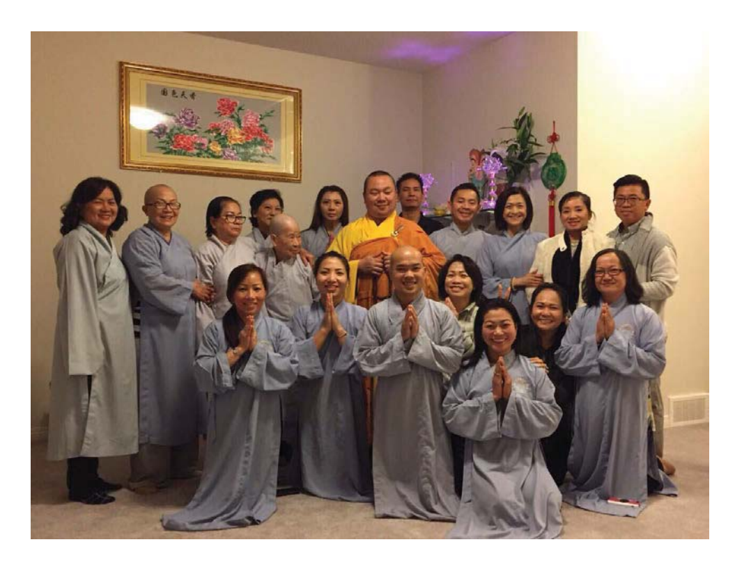
Figure 5: Our community master and volunteers